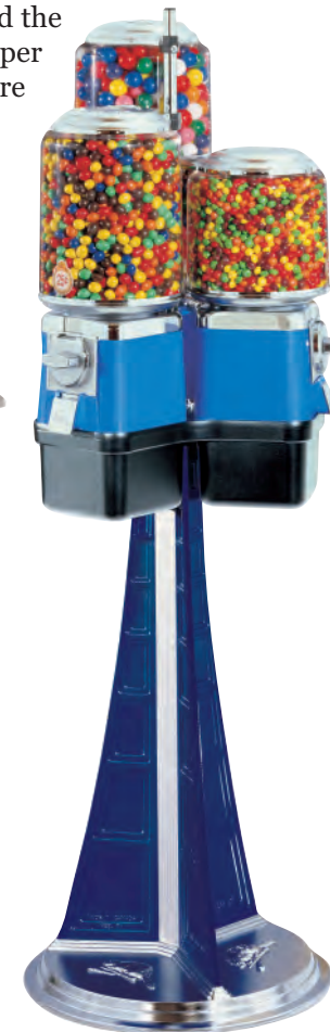
Triton With Cash Drawer